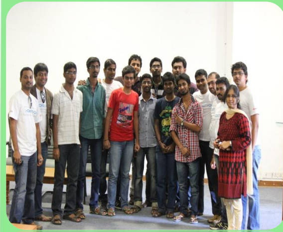
Winners with Ascendant Professionals

Ascendant Technology people distributed the prizes and certificates for the winners and our HOD madam felicitated the Hackathon event.