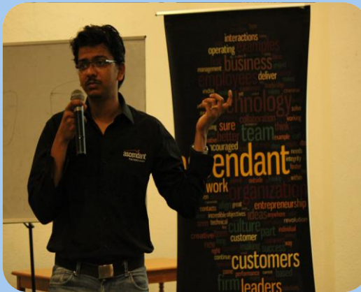
The Ascendant staff conducting the workshop

Alumni of the CSE and IT departments took an opportunity to extend their gratitude for what they have received! A group of dedicated ten from ASCENDANT TECHNOLOGY, wanting the event to be intensive and of high standards, provided all the fundamental requisites a week earlier. All the arrangements were made accordingly by both students and the faculty.