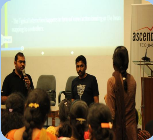
The workshop was interactive with the students