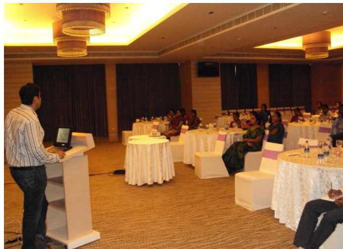
The staff at the workshop