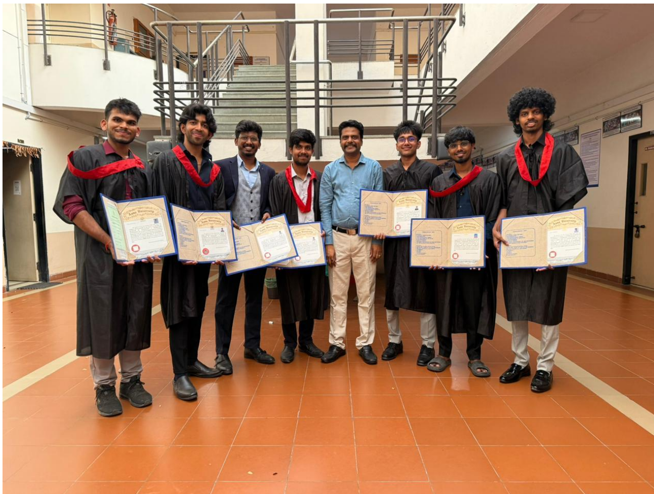
Proud Alumni Moments: IT Graduates Visit the Department