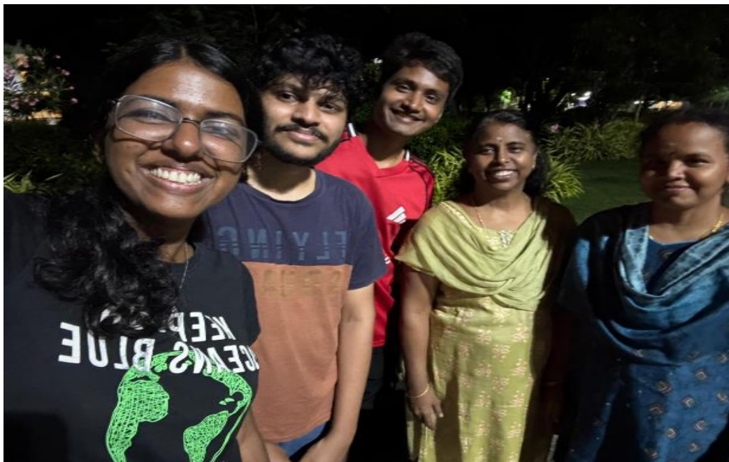
Campus Visit by IT Alumni of the 2018-2022 Batch