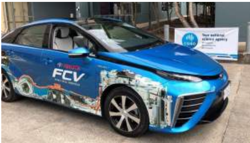
A Toyota Mirai fuel cell vehicle, ready to be fuelled with CSIRO-produced hydrogen

The CSIRO team at the Pullenvale Technology Hub in Brisbane, Queensland, developed a metallic membrane that separates hydrogen from ammonia, while at the same time ensuring the hydrogen is of an ultra-high purity by blocking other gases. Effectively, the process is a reversal of the Haber-Bosch process, used to transform hydrogen into ammonia. In this instance, the CSIRO team takes nitrogen (N) out of the air and makes ammonia (NH 3 ). The idea is that the resulting ammonia would then be shipped to the refuelling depots where the hydrogen is extracted via the membrane in a fairly low-energy process.