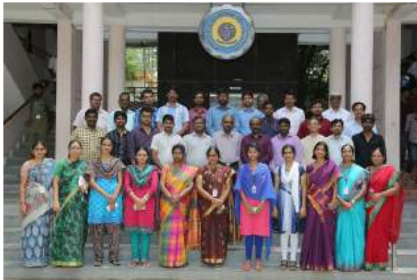
Design Thinking Workshop - Team

Design Thinking is an iterative process in which we seek to understand the user, challenge assumptions, and redefine problems. This is a conscious attempt to identify alternative strategies and solutions that might not be instantly apparent with our initial level of understanding. In the present scenario, where there is growing complexity and ambiguity, change is the only constant factor and education sector is also embracing the changes. New and smarter ways of learning are replacing the conventional learning styles. Design Thinking is adopted by many educational institutions to create a better Teaching –Learning Experience to their educators and students. In all levels of education today there are Project Based Learning, Active learning, Experiential Learning and Student Centric Teaching practiced to improve the learning experience. Educators can apply Design Thinking to improve their work and to provide better learning experience to the students they teach. The design thinking process covered in this program enables participants to understand the potential of interdisciplinary collaboration for co-creation of new solutions to complex problems.