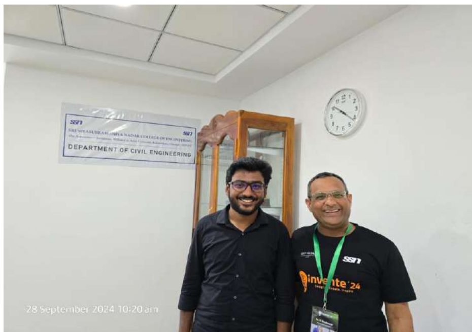
Inspiring Futures: Alumni Engagement at Invente'24 in the Civil Department