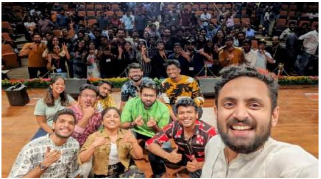
Tribute '24: Embracing the Past, Embracing Each Other - SSN School of Management Alumni Get-Together