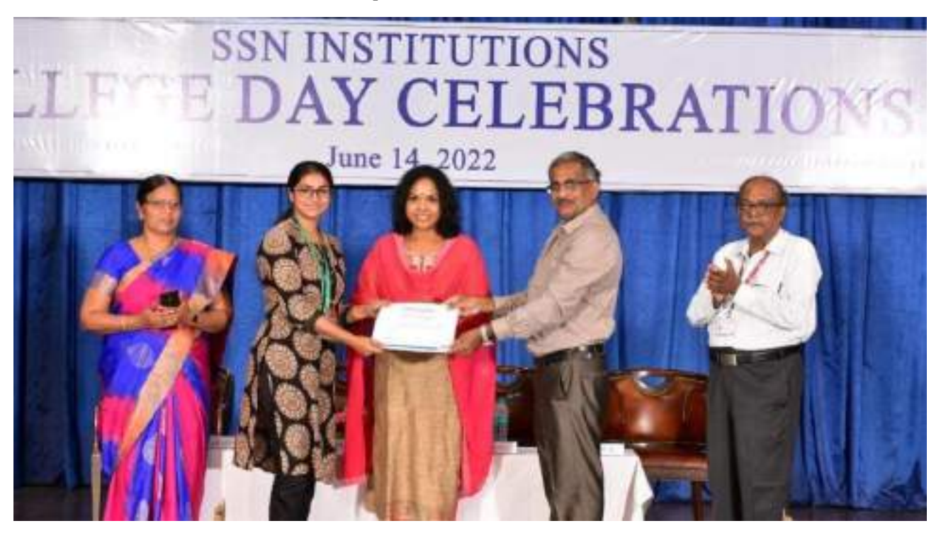
Best Outgoing Student of the BME Department 2022 - Award received during College Day

believing in me! But SSN wasn't just about textbooks and labs. It was about shaping who I am. From leading the Arudhra dance club to volunteering with 3C-Cosmo Comrades Club, I discovered my passion for leadership and making a difference. That's exactly why I spearheaded the SSN Chapter of IEEE EMBS, fostering creativity and knowledge through events and hackathons. Talk about freedom to explore!