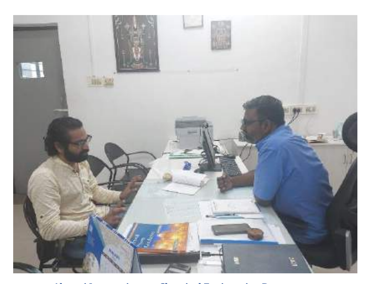
Alumni Interactions at Chemical Engineering Department