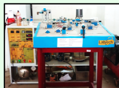
Pneumatic trainer kit