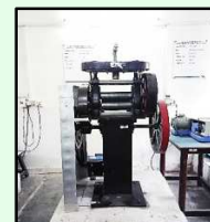
Sheet Rolling Machine