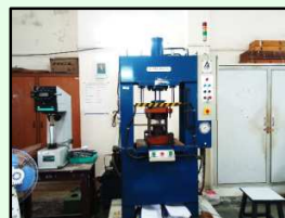
Hydraulic Press (20T)