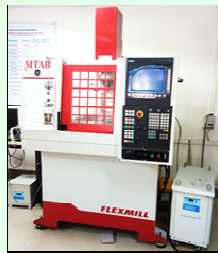
CNC Milling Machine