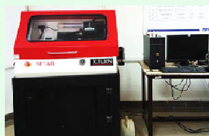
CNC Turning Machine