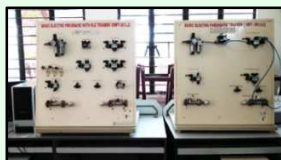
Electro Pneumatic Trainer