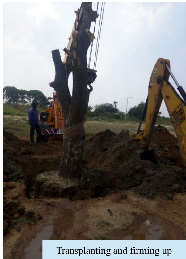
Transplanting and firming up