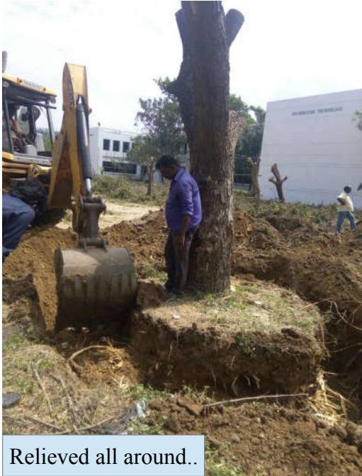
Relieved all around..