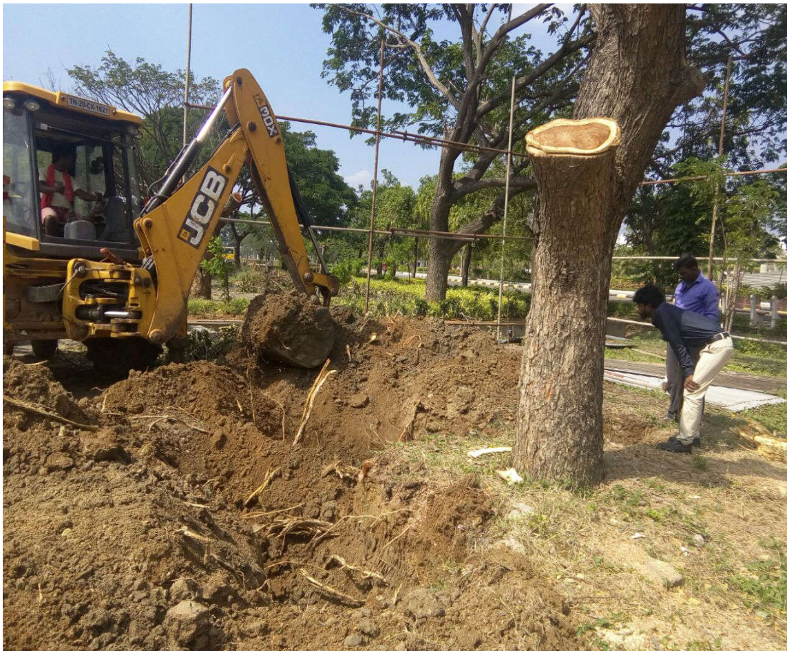
Trimming the branches and digging around without damaging the roots