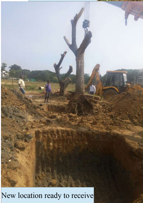
New location ready to receive