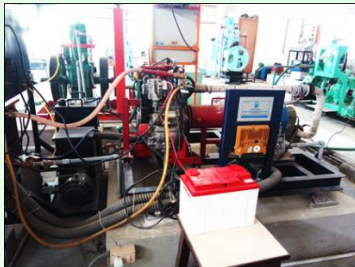
RCCI Engine test facility