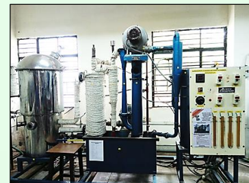
Bio mass gasifier