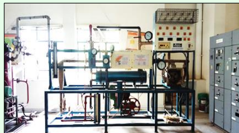
Steam Boiler-turbine unit